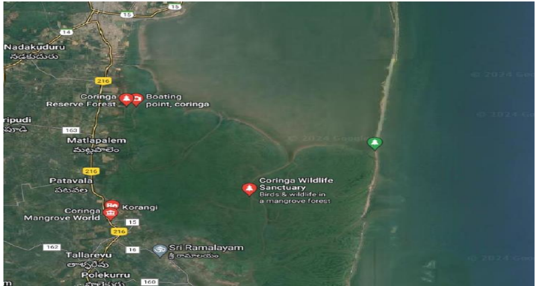
Fig. 1: Google satellite map of the Corangi area representing study area and sampling location

way from the Corangi canal. Agricultural runoff, domestic wastes from the surrounding areas and effluents from the being released into this canal Kakinada Bay waters influence the hydrographical conditions during the flood period and fresh water conditions during the ebb period (Fig. 1).