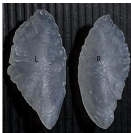
Fig(3) right(R) and left(L) otoliths of N. japonicus .

distributed between 13.4 to 23.2 cm, with body weights ranging from 55.31-218.12 g with the mean of 15.8 cm and 97.4 g respectively (Table I). Otolith measurements (length, high and weight) had respective ranges of 0.56-1.02 cm, and 0.39- 0.57cm, 0.043- 0.136g and means of 0.06cm ,0.45cm and 0.78g respectively (table 2).